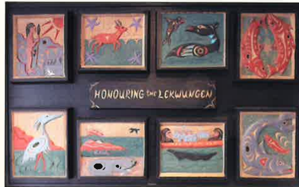
Welcome Panel , by Salish artist Charles Elliott (Temoseng), on display in the Oak Bay Municipal Hall entrance foyer. The cedar carvings are cast in bronze on the Monuments.

Before Europeans arrived in the 1800s, Oak Bay was home to a large First Nations population, ancestors of today's vibrant L'kwungen communities - the Songhees Nation and the Esquimalt Nation.