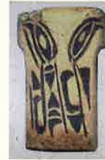
Carved antler tablet bird motif, c. 1550, found near Cattle Point in middens dating back c. 3,500 years.

The eight Monuments respectfully commemorate the history and culture of the L'kwungen peoples and their relationship with the sea and the land.