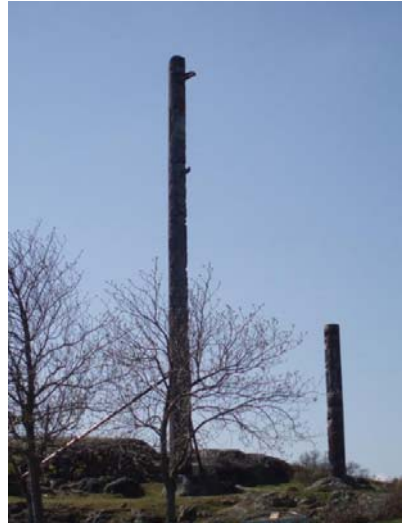
Two totem poles commemorate the original village site