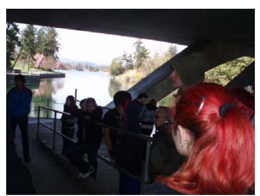
Midden Site under a bridge near the Gorge Waterway