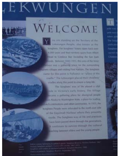
A sign that explains the history of this location

The last location of our field trip was in the heart of downtown Victoria at the Inner Harbour. Here, we learned that the Songhees people originally lived in the area right where we were standing, but in 1911, the Songhees people were moved by the government away from downtown to the site where their reserve is still located today, on the outskirts of Victoria. Two totem poles stand at the location of the original village site to commemorate this history. This part of the trip really brought to life the displacement many First Nations communities experienced as a result of settlement and colonial policies.