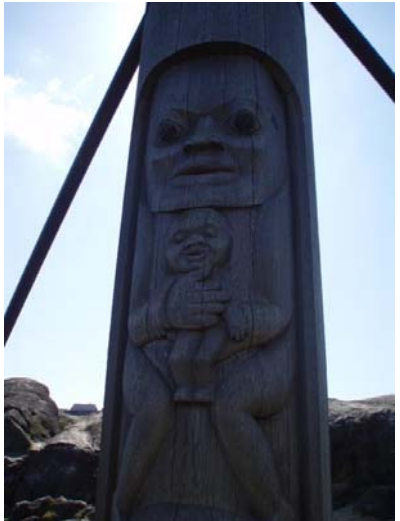
This pole depicts a mother and baby, a close-up of one of the poles