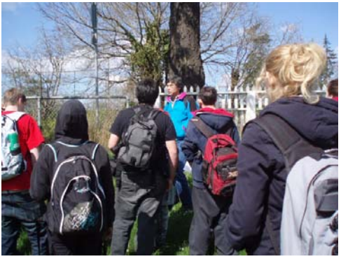
Midden site next to Craigflower School

At the second location of our field trip, we went to look at evidence of First Nations village sites in the urban, Victoria setting. First, we went to a spot beside the original Craigflower Elementary School to look at middens and then we went to a location under a bridge by the Gorge Waterway to look at another ancient midden site and to hear a creation story from that area. It was fascinating to see cultural evidence so close to the city.