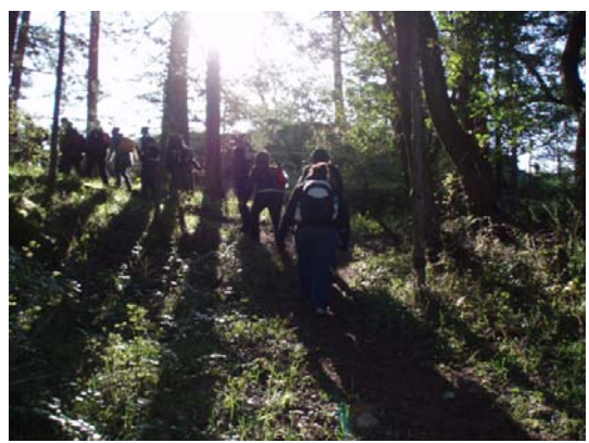
Hiking up into the woods