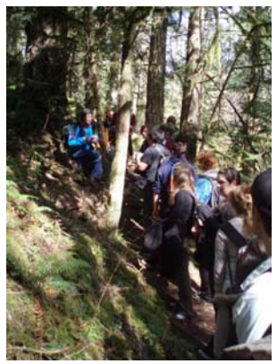
Learning about traditional plant uses