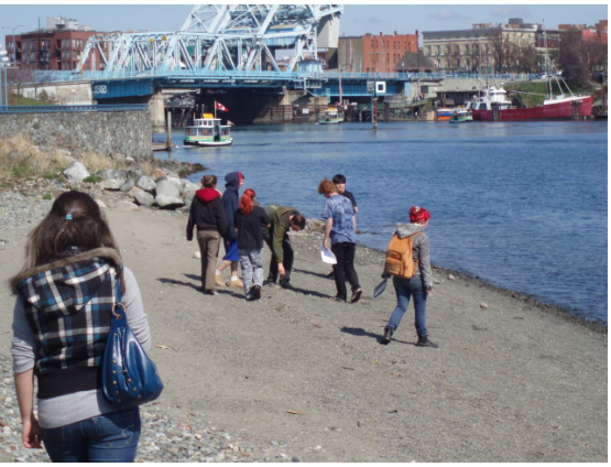
Students walking the beach of what was once part of a First Nations Village site until 1911, now at the heart of busy downtown Victoria