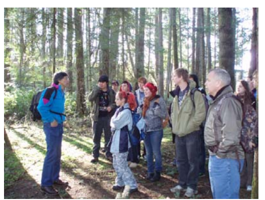
Just before we started our hike.