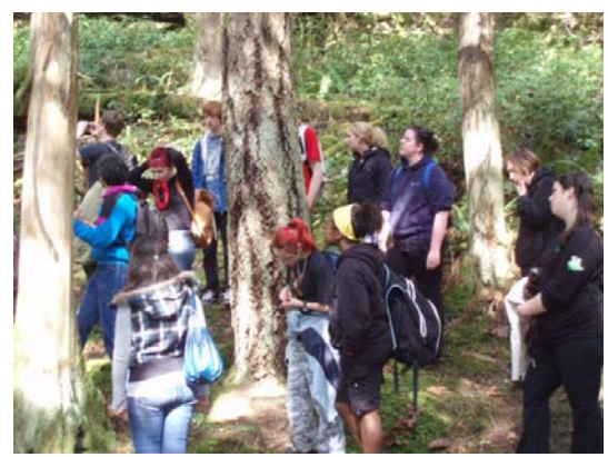
Looking at the old village site, including CMT's and soil middens